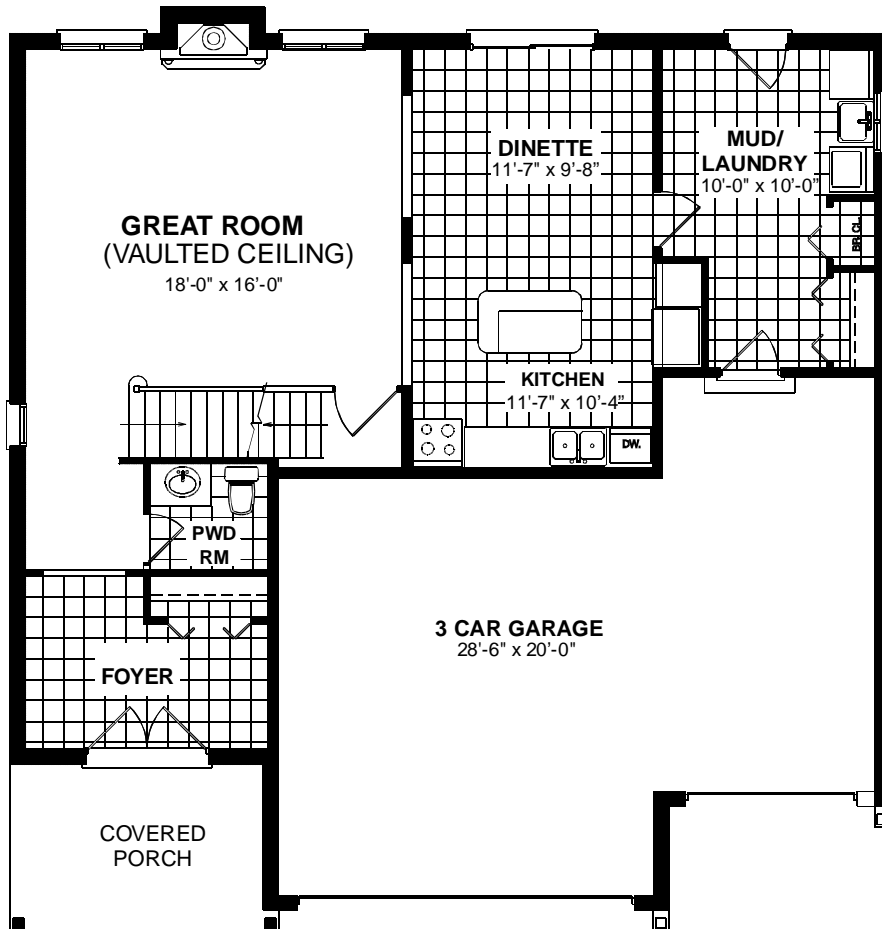
MAIN FLOOR PLAN 1404 SQ. FT.